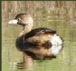
Pied-Billed Grebe (Striped Bill)