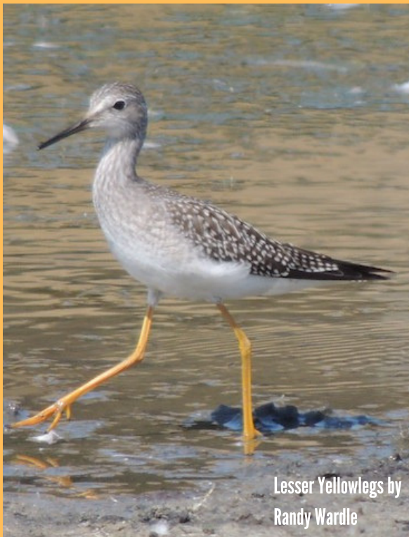
Lesser Yellowlegs by Randy Wardle