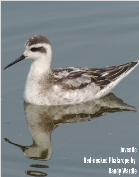
Juvenile Red-necked Phalarope by Randy Wardle