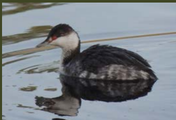
Horned Grebe